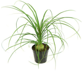
SHIPPED IN A 5.5-INCH POT. PLANT SIZE MAY VARY BASED ON GROWING CONDITIONS.

Note: Some leaves may appear wilted or yellow upon arrival. This is due to the stress of shipping and is nothing to worry about. Water the plant and let it recover in a shady location for a few days, then gently remove any foliage that does not recover to allow for new growth.